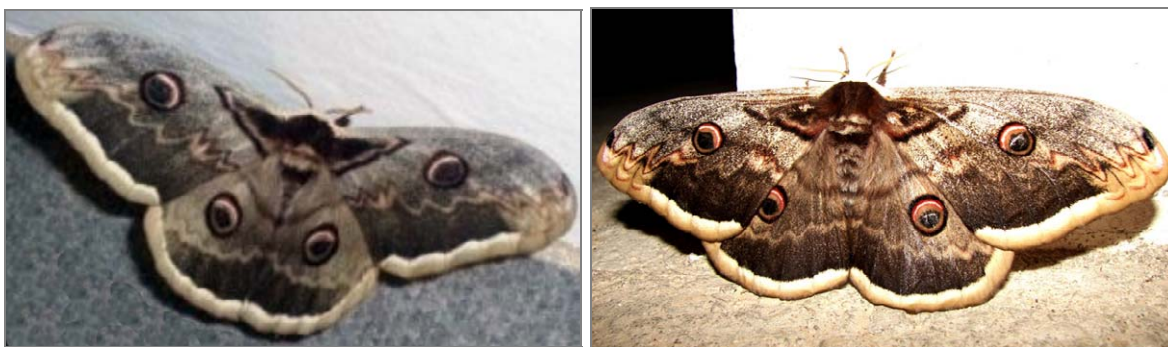
Figs. 1 - 2. Demonstration of upper side of male (left; Čapljina, May 11 th , 2009) and female (right; Zavala – Popovo polje, May 11 th , 2007) species Saturnia pyri (Denis & Schifferrmüller, 1775)

One photo of male taken on location of Čapljina May 11 th , 2009 has been found on Internet (Fig. 1-2).