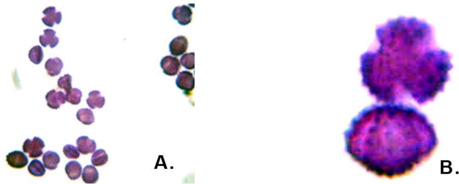
Figure 5: Aster albanicus Degen. Population Librazhd. a. Microscopic field of pollen granules.