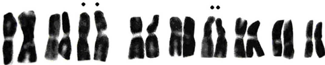
Figure 7: Photocariogram of Aster albanicus Degen. population Librazhd.

For a more detailed characterization of cariotype Aster albanicus Degen. for the population of Librazhd the cariotogram and ideogram were set up where apart from the number, typology of chromosomes, is also given a graphic presentation of the order of chromosomes of various types from the chromosomic set.