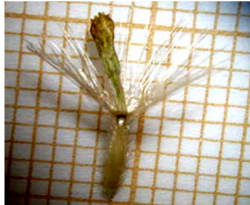
Figure 4: Aster albanicus Degen. Crest Hair.

Most of these plants reveal low values of the general length of the plant, less than 15 cm considered as the lowest limit of the general length in the Albanian Flora (Vangjeli et al., 2000).