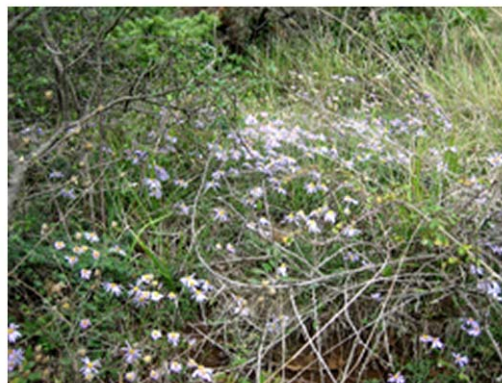
Figure 2: Aster albanicus Degen. population Librazhd.

Aster albanicus Degen. is a Balcan sub-endemic species, of which two sub-species are known in Albania: Aster albanicus Degen. sub-species paparistoi Qosja in the conifer coast and Aster albanicus Degen. sub-species albanicus in the ultra basic rocks (Kukës, Shkopet, Ulzë, Librazhd). (Zekaj et al., 2009)