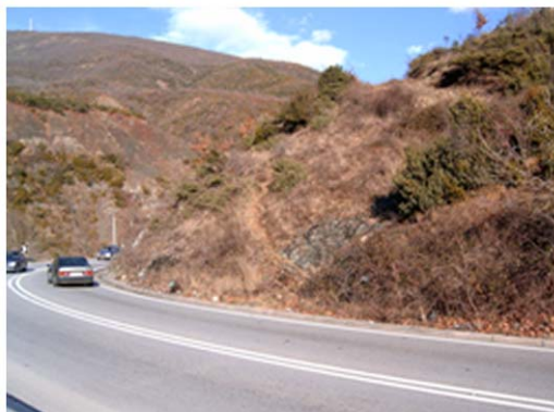
Figure 1: Growing Habitat for Aster albanicus Librazhd (Bridge of Murrash).