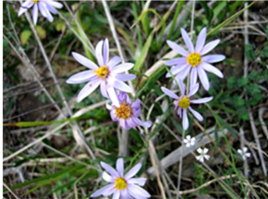
Figure 3: Aster albanicus Degen. Flower details.