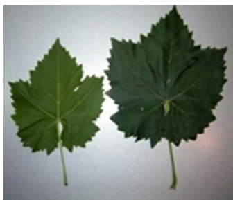
Figure 3: Leafs of grape-vine King's Ruby .

LEAF: New leaf has a bronze green color in the upper side of leaf, anthocyanin pigment is tinge and fuzz between the venation systems is missing. The grown leaf has principal venation system 20.03 cm long, with a pentagonal form, lobule with 5-7 pedicellate, dark green color without anthocyanin hue. It has a flat and excellent profile in the upper side of leaf. The teeth-rectilinear leaf form has an average length of 15-17cm, density of hairs is small or absent and the average stem length is 11.9cm. It has a pentagonal form and five lobules. It has a chest form within leaves, (Figure 3). Leaves were taken during the summer, preferably those located between the 8th and 11th plant nodes.