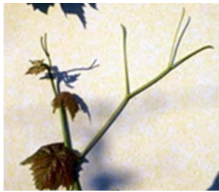
Figure 2: Sprout of vine-grape King's Ruby .

The most intensive growth of sprouts is the period from June to July 15 th . The vegetative growth period coincides with the typical cultivars of the zone. The annual average growth is bigger than local cultivars. The highest yield rate is in the segment over the plant nodes 3-5. It has a high production coefficient (Susaj & Kukali, 2009).