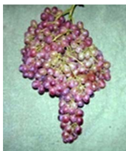
Figure 5: Clusters of grapevine cv King's Ruby .

The length of bunch of grapes is classified as very long (32.3cm), and average width (16.2 cm). The ratio L/l is (1.99). Number of grape berry is 322.7 per bunch of grapes, and constitutes variety of bunch grapes with many grape berries. Stem of a bunch of grape is long (11.1cm). Form of a bunch of grape can be according to IPGRI. It can be conical, pyramidal, cylinder, with wings, rump, composed, and dub. Variety King's Ruby is characterized to have clusters with wings and compact bunch (Figure 5).