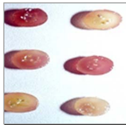
Figure 6: Fruit (grape) cv King's Ruby.

Grape berry has pink maroon in green colour. It is in conical form with acme, and layer of purine covers the whole surface of fruit's pith. Fruit's pith is pasted with pulp, and is very thin and frail. Fruit is brittle. Pulp is strong, not watery, sustainable, with a light colour of vinegar, rattling, with a dominant pink color. Presence of prune is average. Epidermis (outer layer of skin) + hypodermis are very thin (100 mkr), with an easily colored pulp (Somers & Veritte, 1988). Quantity of must is average. Pulp is sustainable with a light flavor. Stem's fruit is 11.1mm. Fruit connection with the stem is light and there is no formation at all. Forms of grape berries under IPGRI could be 10. Grape berry of the King's Ruby is in the extended elliptical form (Figure 6).