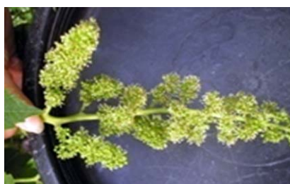
Figure 4: Flowering of grape-vine in cv King's Ruby .

Flower is shown as a composed cluster. The number of flowers in a cluster is relatively large and goes over 300. Flower is closed, in a pellet form with green color in yellow. In general, it is functional female. The flowers are female and male organs, with a healthy pistil and craze. Number of flowers grown from the bud of branches pruned from a grapevine results 1.43 flowers per sprout. It has an average coefficient of absolute production (1:43). Length of the first flower is (18:25 cm) with medium length. Connection of flowers is 73.8% (Figure 4).