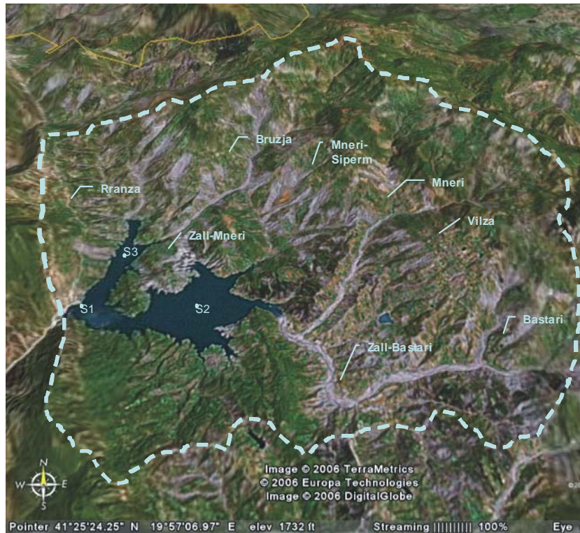
Figure 1: Watershed of Buvilla basin with three sampling stations (S1-S3) and several villages

emergency a powdered activated carbon at clariflocculation step, is added, using a PAD Dosing System with a silo storage.